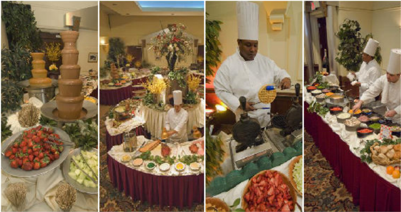
Chocolate & Caramel Fountains